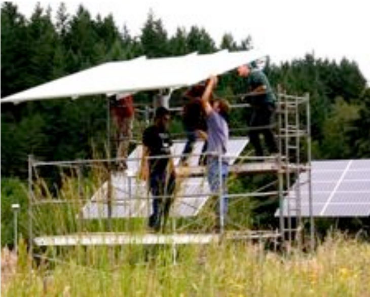
Lane Community College, Oregon